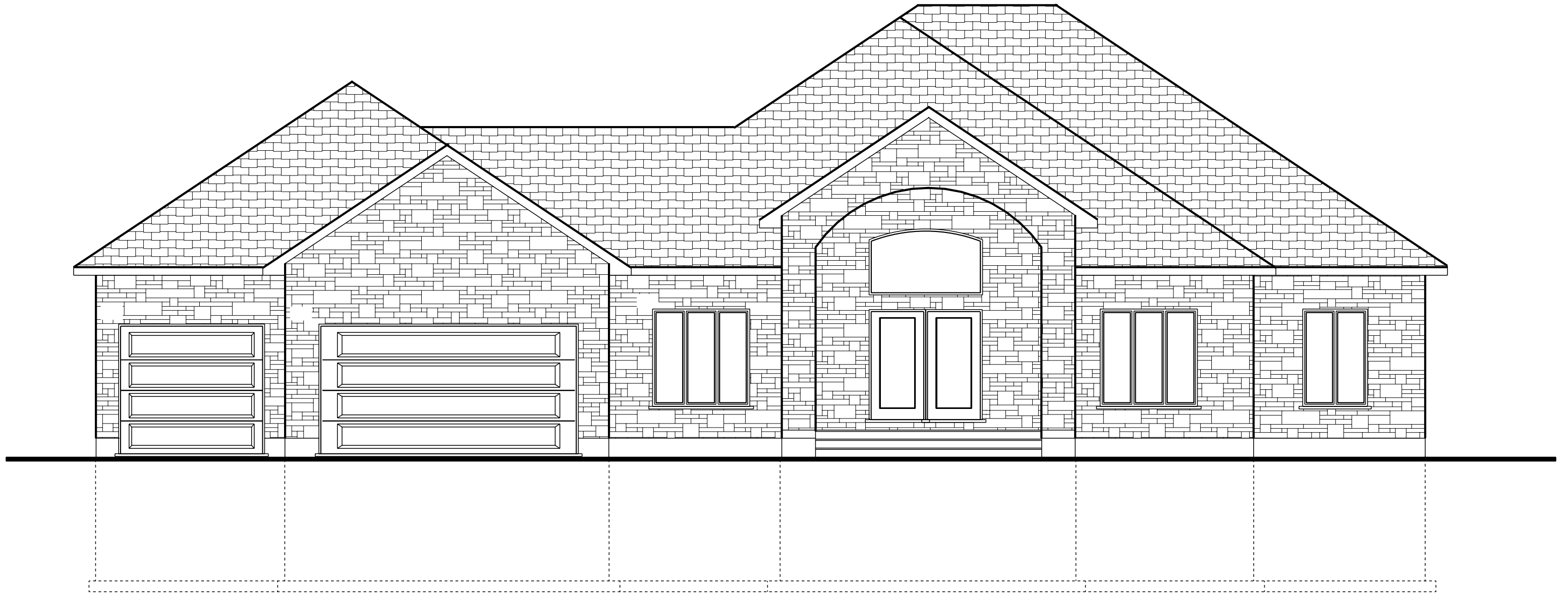
FRONT ELEVATION FLOOR AREA 2395 SQ FT